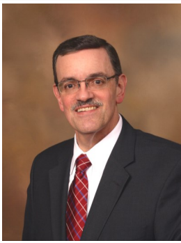
John Yates Minister of Education